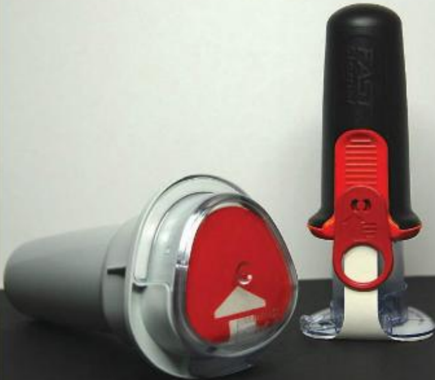
FAST Combat a jeho taktické plastové pouzdro